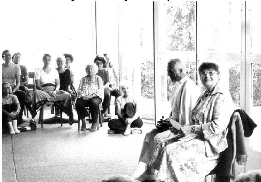
Question Hour in the Yoga School in Ponte Tresa

Please feel free to contact me if you have any further questions!