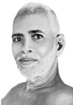
Sri Ramana Maharshi