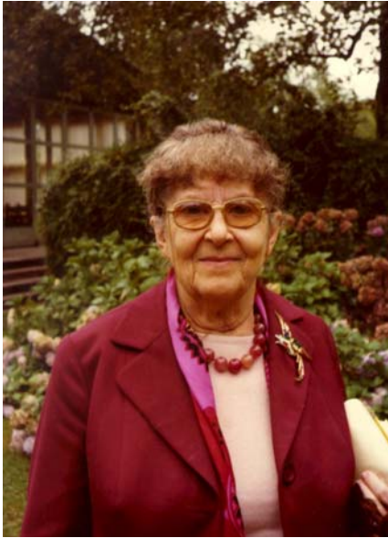
Elisabeth Haich Yoga Hall Tessin